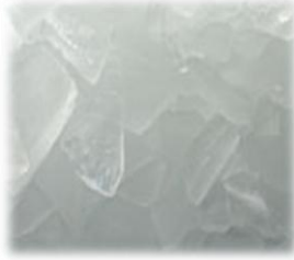
Plate ice introduction: Plate ice is a kind of irregular sheet ice with about 40×40mm~80×80mm in size, and 10 mm~15mm in thickness. The thickness can be adjusted according to ice-making time with the maximum gauge being 25mm. Plate ice is a kind of thick and transparent ice which has good air permeability and a long shelf life.

Application fields: Plate ice is usually used for ice storage systems and is also applied to concrete mixing plants, chemical plants, mines, fresh vegetables, fishing and aquatic insulations.